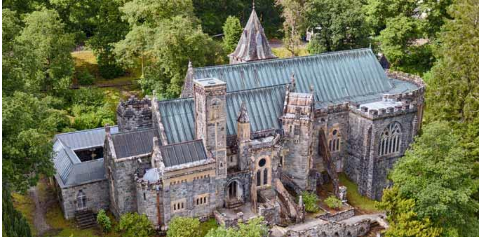
St Conan's Kirk, Loch Awe, Argyll

Previous experience of successfully delivering a repair project