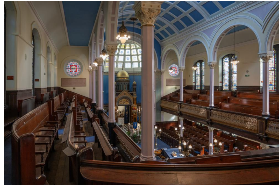
Garnethill synagogue, Glasgow