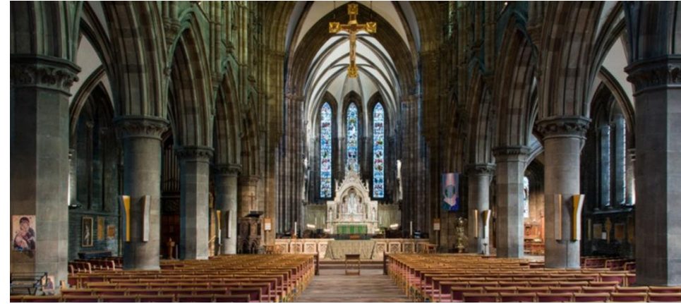
St Mary's Cathedral, Edinburgh

Rich in culture and collections, places of worship tell the story of the religious, social and economic changes of the people of the UK. We recognise the scale of the challenges facing places of worship and those who care for them, and we are committed to supporting them through that change.